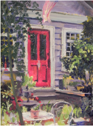
Shane McDonald: Cresthill Garden , 12 x 9 in. oil on canvas, 2010