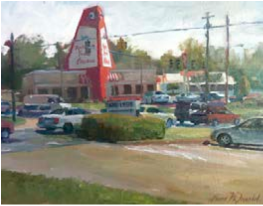
Shane McDonald: The Big Chicken , 9 x 12 in. oil on canvas, 2012